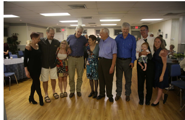
(our family --)

We send our friends and family love, 'Cause they're the ones we're thinking of. In this season of joy and mirth, Our prayers go forth for peace on earth.